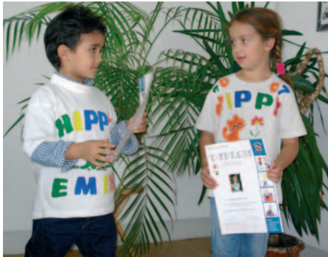
Fit for school with the HIPPY certificate